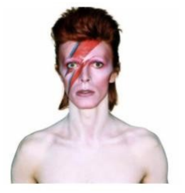
Was life on Mars hunky dory for me?