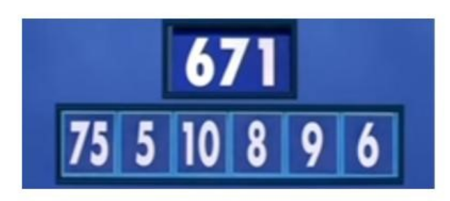
Can you calculate this figure within 30 seconds?